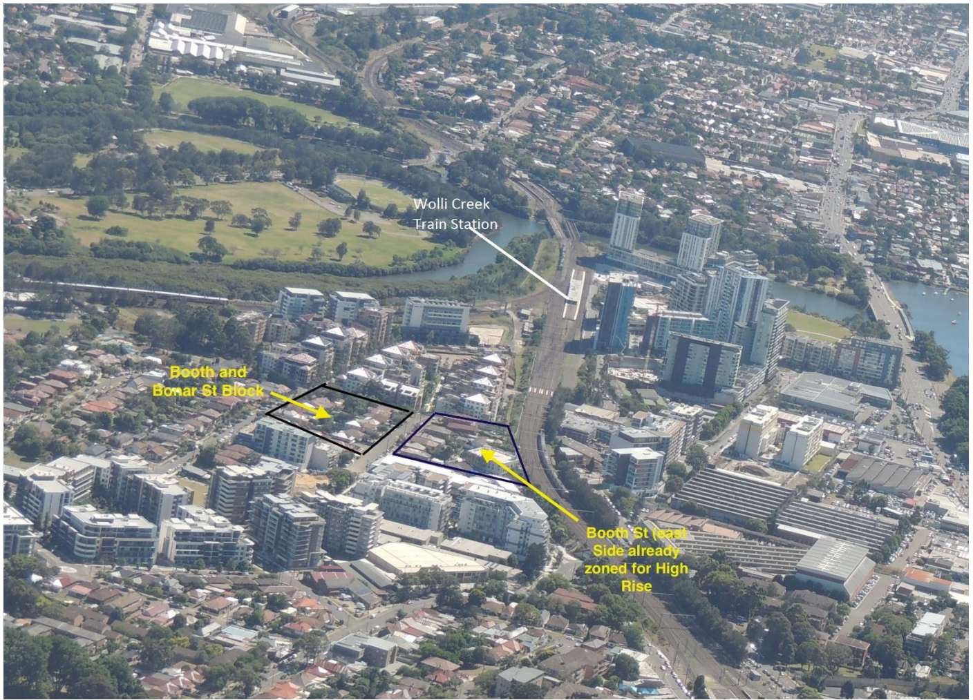
Attachment 2: Overview of Site Location